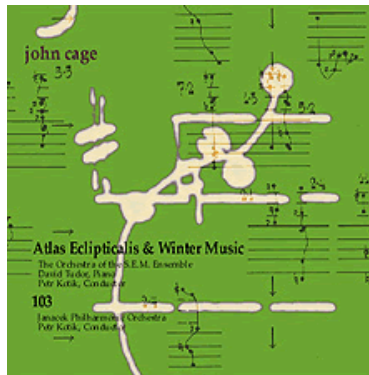
Cage: Atlas Eclipticalis