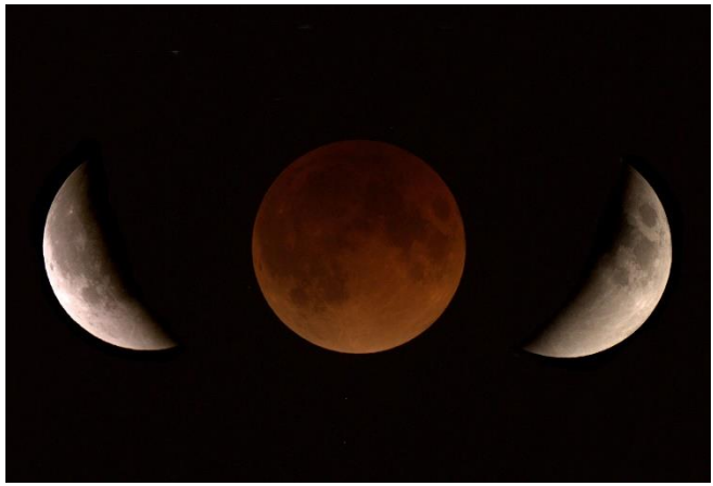
Note the round shadow

Suggest that they take a careful look at the shadow of the Earth as it moves across the bright face of the Moon. What shape is it? The round shape of the Earth's shadow suggested to the ancient Greeks, more than 2000 years ago, that the Earth's shape must be round like a ball. Eclipse after eclipse, they saw that the Earth cast a round shadow, and deduced that we lived on a ball-shaped planet (long before we had pictures of it from space).